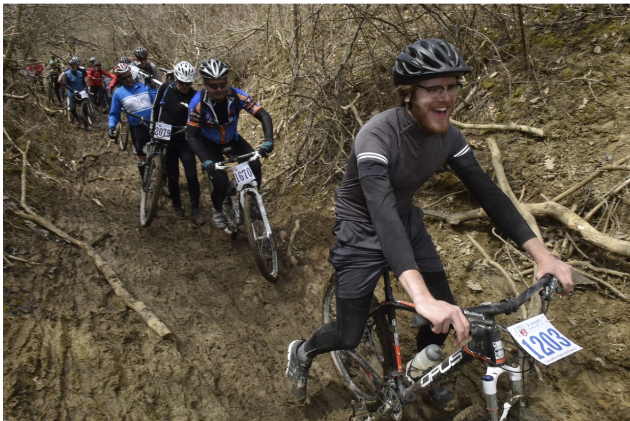
Paris to Ancaster, 2017